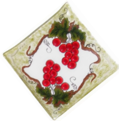
Glass Plate with Grapes With Helen Daum Sunday 1:00 P.M.