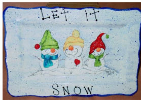
Let it Snow With David Hoff

Students will complete a wonderful 6" round ruffled glass plate with EZ-Namels. They will learn how to blend colors for the leaves and do actual stroke work on glass for the first time to create a wonderfully bright and cheerful Spider Mum Plate. All color is included and the student will take the piece and the slumping mold home with them. Bring your favorite brushes and a take home box.