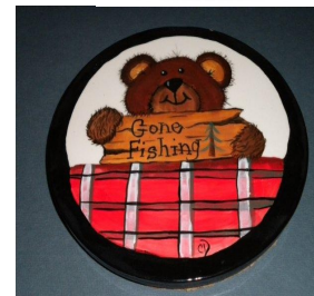
Bear Hot Plates