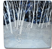
Mayco's Foundation, Cobblestone and Stroke & Coat Glazes

This next winter season enjoy these three cute snow boys, with their hats pulled down over their eyes. Duncan Oh-Four Bisque will be used with Concept. General Supplies: ware and color included. Students need to bring: #2 Round, #4 Round, #2/0 Detail, Palate Knife and Sponge.