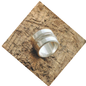
Flat-Band Silver Ring With Katie Baum

Design two beautiful pieces using Mayco's Foundations, Cobblestone and Stroke & Coat glazes. Create a winter wonderland and fun holiday serving platter. Blend wet Stroke & Coat for shadows and depth along with using raffia, wax paper and Liquid Mask. Bring along assorted brushes, cleaning tool, old credit card and synthetic sponge.